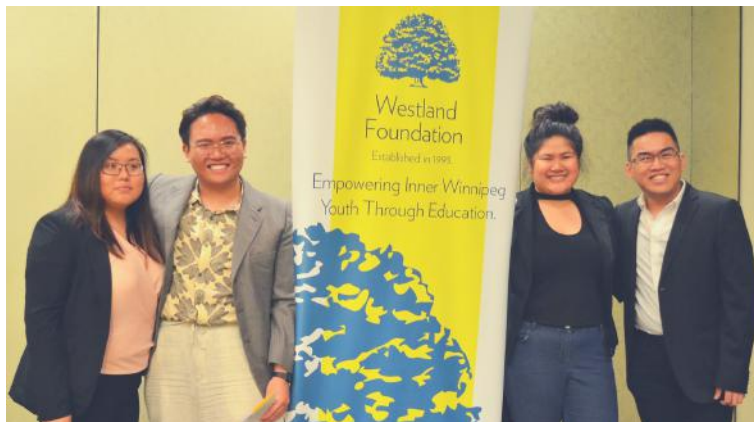
Westland Scholars at the 2017 Breakfast