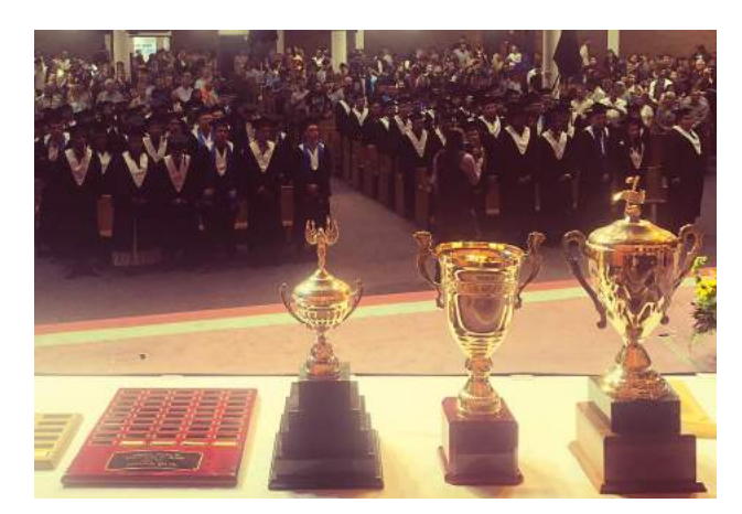
St. John's High School's 2018 Convocation Ceremony

We are delighted to be joining our inner-Winnipeg schools in their recognition and convocation ceremonies this June and July 2019.